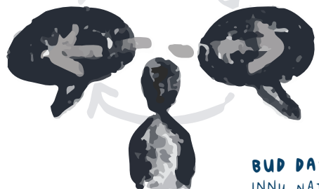
BUD DAVIS INNU NATION

FROM AN INNU PERSPECTIVE, INNU-AIMUN IS STILL QUITE STRONG, BUT MORE RESOURCES LIKE THIS ARE NEEDED TO HELP GROW LANGUAGE INSTRUCTION IN SCHOOLS