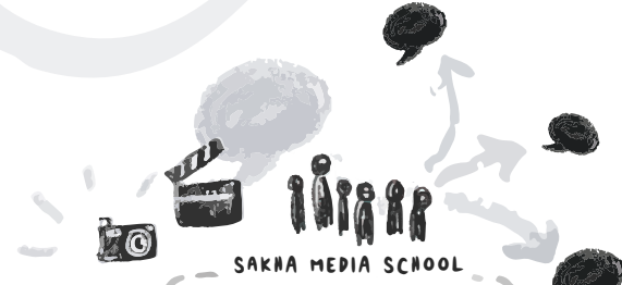
SAKHA MEDIA SCHOOL

TEACHING YOUNG PEOPLE HOW TO LEARN & SPEAK THEIR LANGUAGE THRU VIDEO & MEDIA MAKING